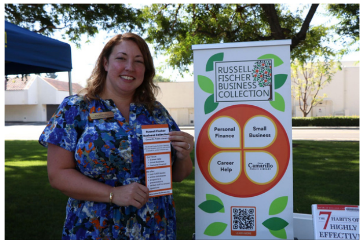
Outreach Event - 2022

Over the past year, the RFBC has reviewed and added Gale Business: Entrepreneurship and Gale LegalForms databases to better assist the small local business community with research and practical resources. Traditional offerings such as Data Axel and Value Line have also been kept.