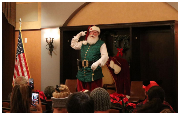
Santa Storytime - December 2022