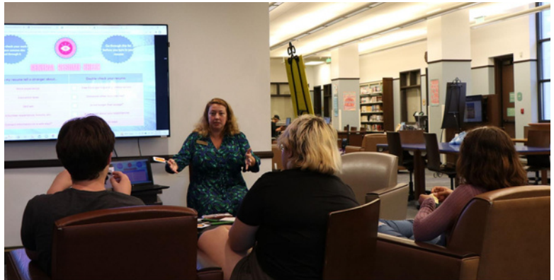
‘Tis the Season to Get Hired - October 2022

Weekly after school programs help teens de-stress, including the popular crafternoons, Dungeons & Dragons, board games and book club. During finals week, the Library offered mindfulness and meditation workshops to support wellbeing and healthy habits.