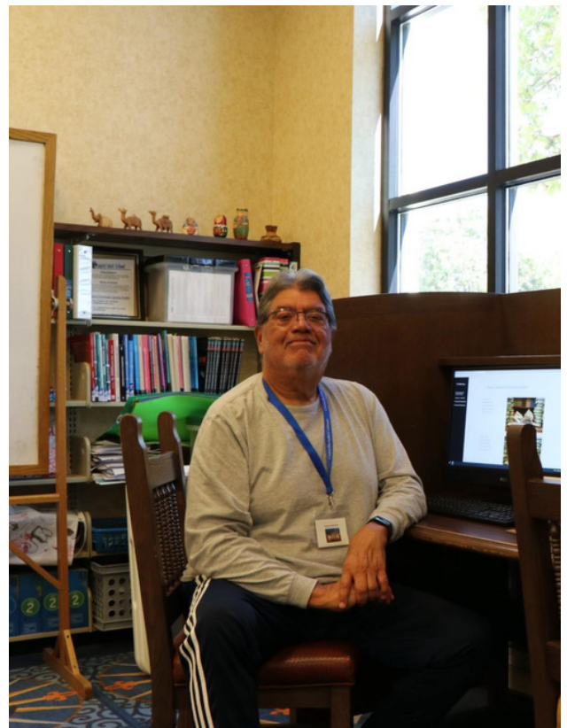
Homework Center - September 2022

Camarillo Public Library continues to prioritize enrichment and enjoyment. In December, the Library hosted a special guest from the North Pole. Santa Claus greeted 182 attendees and sang holiday classics like "Rudolph the Red-Nosed Reindeer." Children were able to meet Santa afterwards and take photos. The Library also added Toddler Storytime on Tuesday mornings and Preschool Storytime on Thursday mornings, with over 100 kids attending each week.