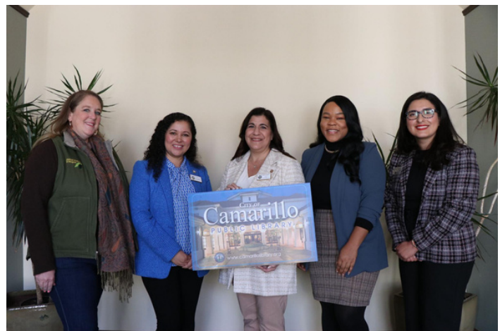
RFBC Women at Work Panel - March 2023