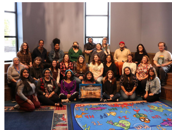
City of Camarillo Public Library Staff

Starting a book club has never been so easy for Camarillo residents. The Library launched Book Club in a Bag , which contains a wide selection of new titles along with eight copies of a book, information for the book club leader and a list of discussion questions. Patrons can request a title through the Library website, and Book Club in a Bag kits can be checked out for up to six weeks.