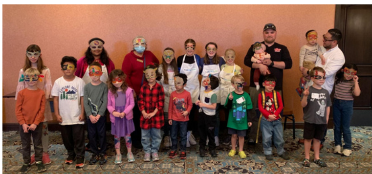
kidSTREAM upcycling workshop - January 2023