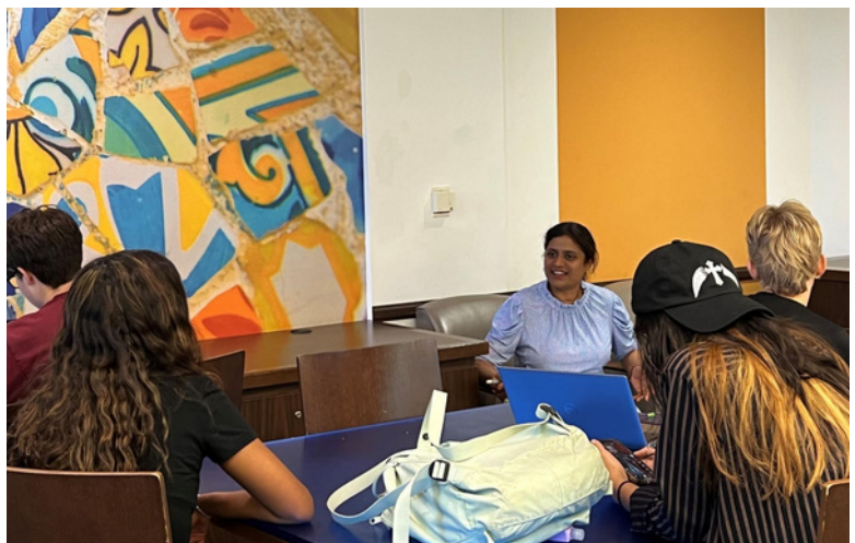
Women in STEM - Fall 2022