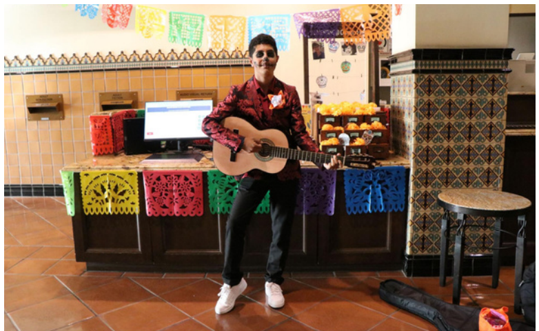
Teen Halloween Costume Contest - October 2022