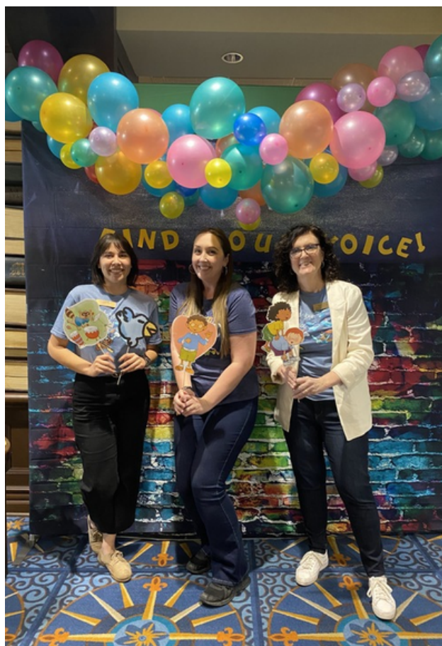
Youth Services Staff, "Find Your Voice" Summer Reading Kick-Off Event - June 2023

The Library partnered with kidSTREAM to provide two sustainable workshops under our Cam I Am Sustainable initiative. 50 people participated in the workshops, which involved upcycling household materials into beautiful creations.