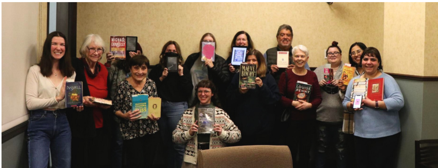
Silent Book Club - 2023

Partnership expansion was another major focus this year. With the needs of Camarillo seniors in mind, the Library began development of its new Senior Resources webpage in collaboration with the Camarillo Council on Aging. The Council presented a series of senior resources, covering wellness and caregiving, public benefits and legal issues for the elderly. The Camarillo Health Care District complemented these efforts with their own series on the legal needs of seniors, discussing fraud protection, elder abuse, caregiving and estate planning.