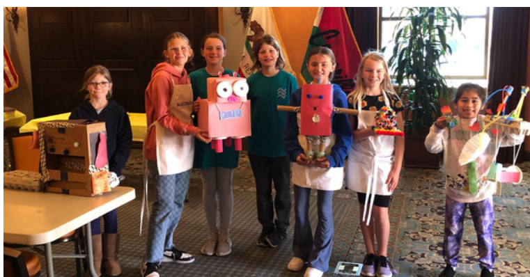
kidSTREAM upcycling workshop - April 2023