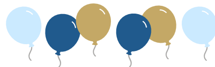
Sweet 16 Library Birthday - March 31, 2023